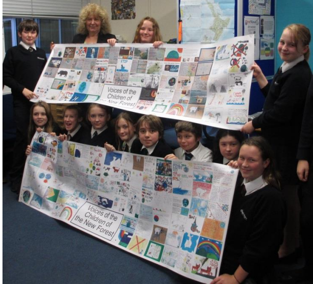
Left: banners with Applemore College's super Eco Group. right: banners reach New Forest School during their Christmas party! Here, children display them to the entire school.

Unexpectedly, the banners gave extra value. Firstly interested members of local groups such as Friends of the Earth were given the opportunity to explore them. Then each school was allowed to borrow the banners for a day or two: thus began their journey round the New Forest. At the time of writing (February half term) that journey is still incomplete with three schools waiting their turn. Schools very much enjoyed displaying the banners and showing them to children in assemblies or classes.