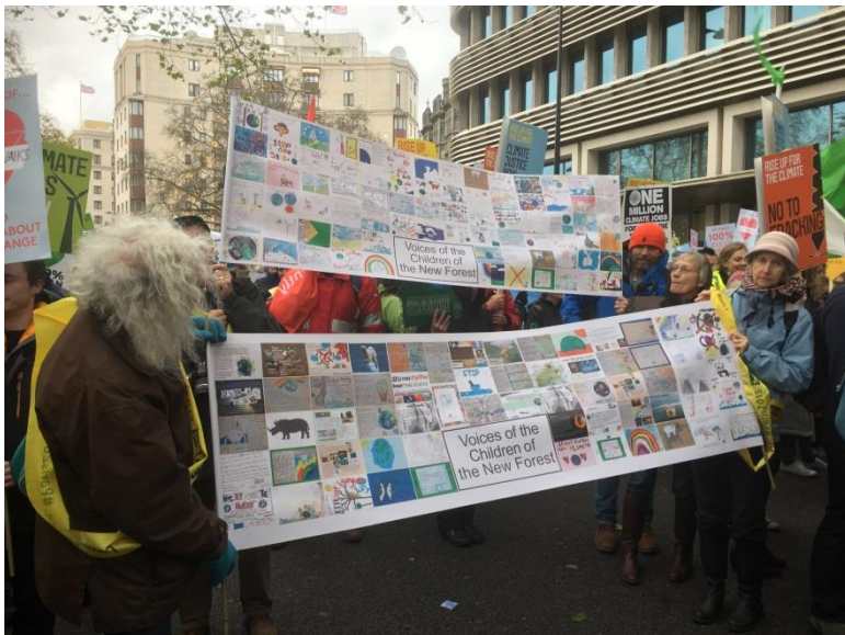
Left: Postcards to Paris during the London climate change march.

Friends of the Earth generously funded two professionally made banners for the London Climate March of 29 th November. They showed collages of the most insightful Postcards to Paris from the children of the New Forest. Each school that took part was represented and, in London, the banners were a much photographed source of huge public interest. Postcards from the schools in Pennington; Priestlands, from Pennington Juniors and from Old Lady St Joseph Schools, were also displayed in St Marks Church during the two weeks of the Paris talks.