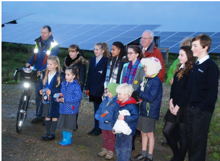
Left: the prize-giving ceremony at West Solent Solar farm