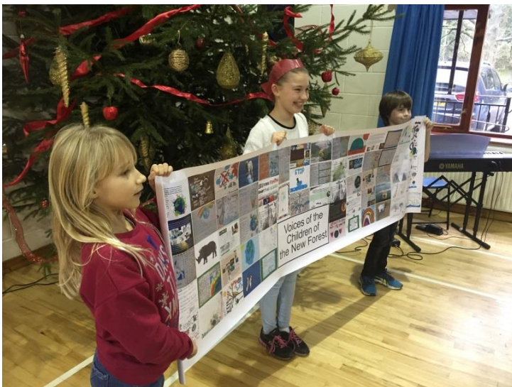
Below: banners reach New Forest Primary School during their Christmas party! Here, children display them to the entire school.

This has been the story of extraordinary generosity on the part of both individuals and organisations, such is the strength of feeling about climate change.