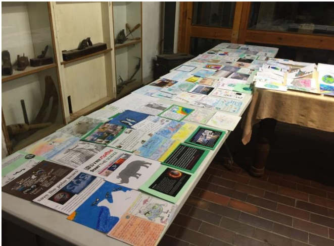
Below: sorting and reading a few of the cards